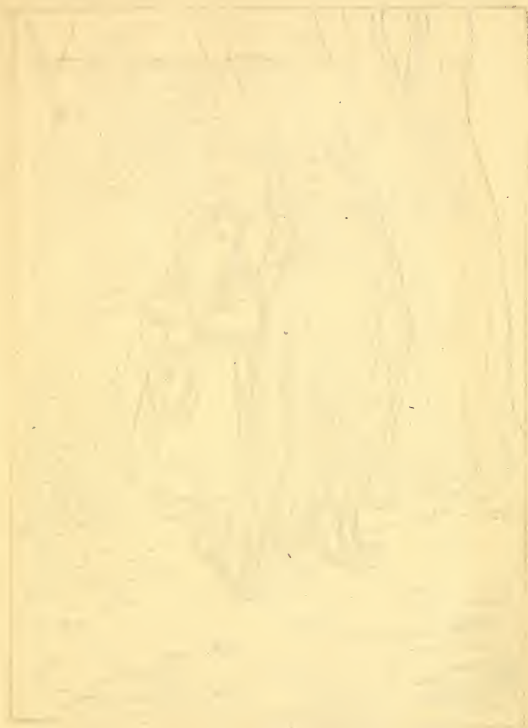
FIG. 1. [Illegible text]